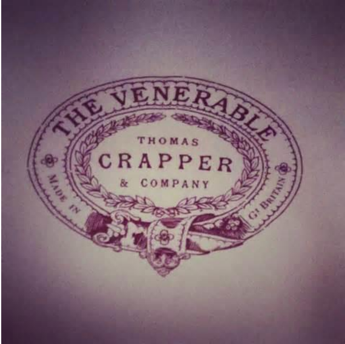
The Parcel Yard Kings Cross Station London N1C 4AH